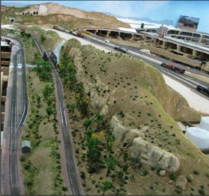
A look at the Bay View Bridge