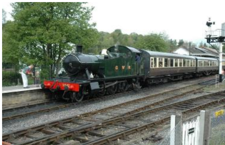
This is at Buckfastleigh and I think that the GWR is the original engine.

We spent the last full week in Cornwall just near Kingsbridge. I had forgotten how narrow the Devon lanes are!! Although we did not get to travel on any of the local railways we did spend some time at Buckfastleigh railway station and the model shop. I even went as far as buying a standard class 4MT tank loco in 00 gauge.