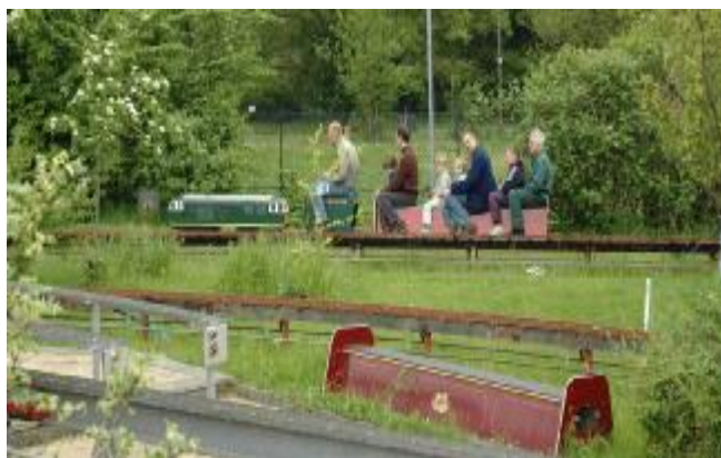
Guildford Model Engineering Society layout