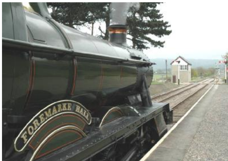
A Hall class just about to leave Cheltenham. Wonderful smell of smoke, heat and oil.

We spent the last full week in Cornwall just near Kingsbridge. I had forgotten how narrow the Devon lanes are!! Although we did not get to travel on any of the local railways we did spend some time at Buckfastleigh railway station and the model shop. I even went as far as buying a standard class 4MT tank loco in 00 gauge.