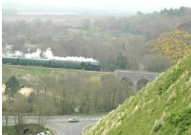
The train from Corfe Castle.