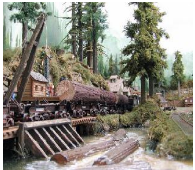
Here is another dream picture.