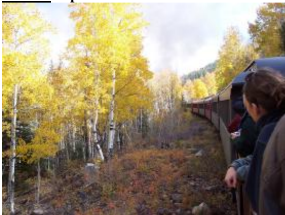
Picture: Aspen trees

Our train continued to Osier where we stopped for lunch. At Osier we met the westbound train from Antonito. During lunch the train's crew switched engines so we continued our trip on