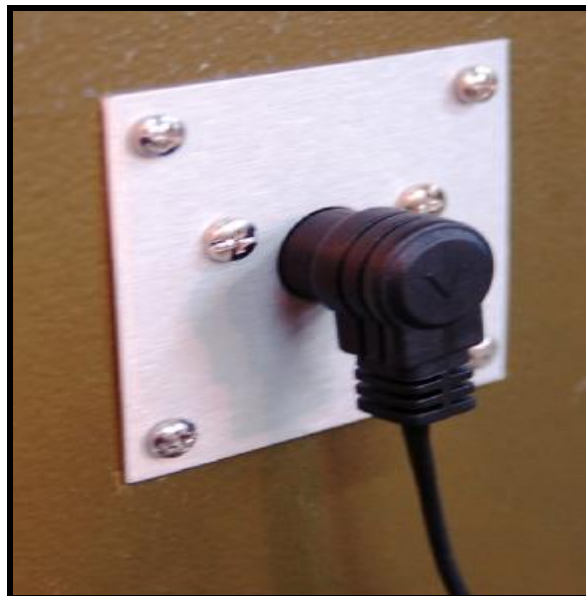
Right angle DIN connector correctly plugged into a fascia plate.

Plug the DIN connector into an available round DIN socket that is within the fiddle yard . (The DIN sockets are located on anodized aluminum squares along the layout fascia.) The correct orientation is with the cord at the bottom of the right angle jack, as in this photograph.